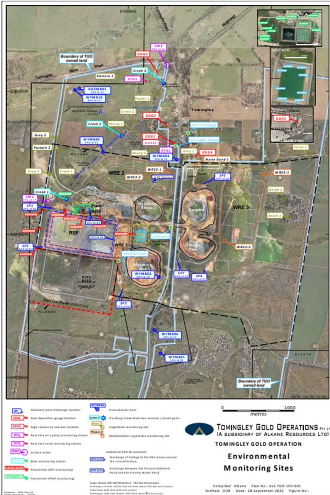
Figure 2. TGO Environmental Monitoring Sites

Figure 2 indicates the location of where monitoring is undertaken for the project. Any additional monitoring undertaken will be discussed within the body of this report.