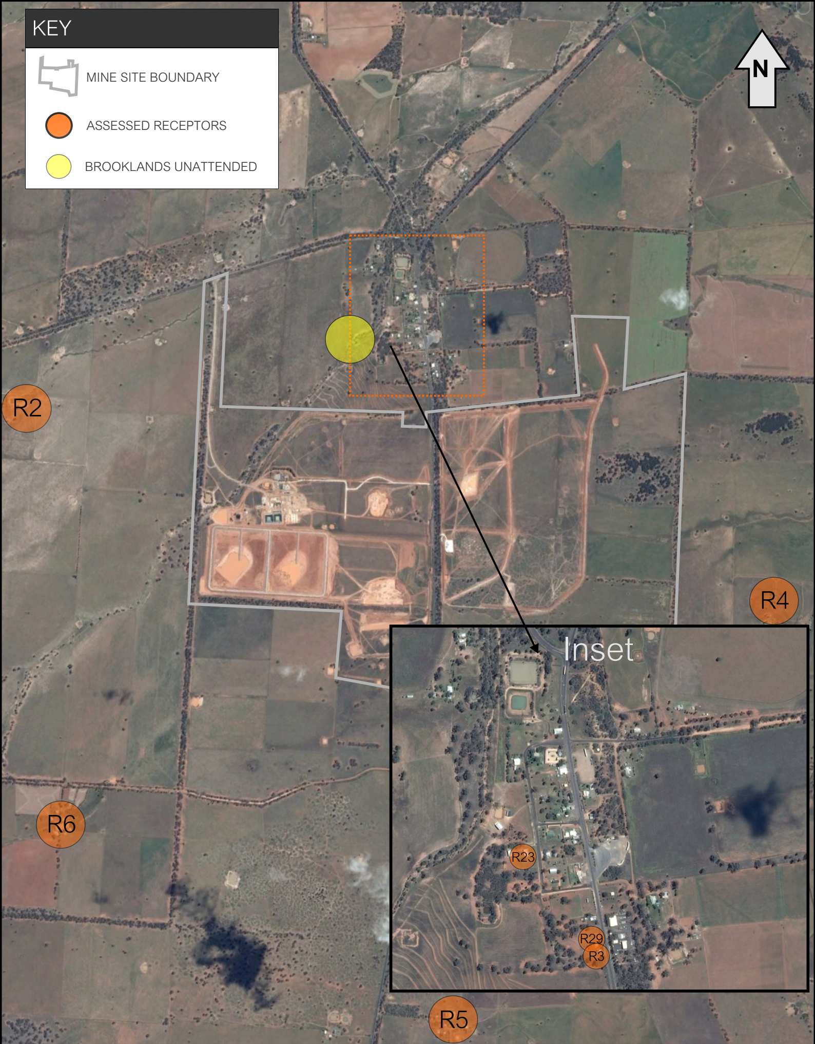
FIGURE 1 - LOCALITY PLAN AND ASSESSMENT LOCATIONS

TOMINGLEY GOLD MINE EPL NOISE MONITORING