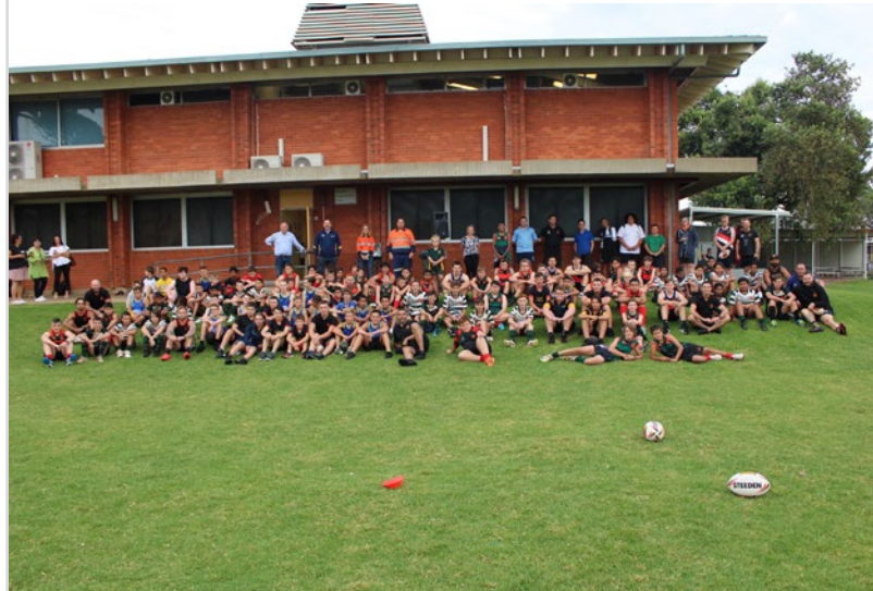
TGO is now a major sponsor of the Clontarf Foundation's Narromine Academy, which held a Rugby League "Super Training Session" in March.

partner organisations. It also demonstrated some of the work the Clontarf Foundation undertakes to encourage young indigenous people to complete their education and pursue employment after completing Year 12.