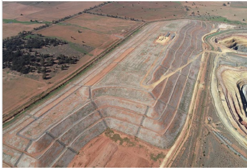
The difference a year (and some rain) makes. WRE3 in 2019 (above) and 2020 (below).

Meanwhile, vegetation growth on our two rehabilitated WREs has accelerated over the past year, thanks to all the rain we've been having. The two aerial images of WRE3 show the stark contrast in cover since the drought broke.