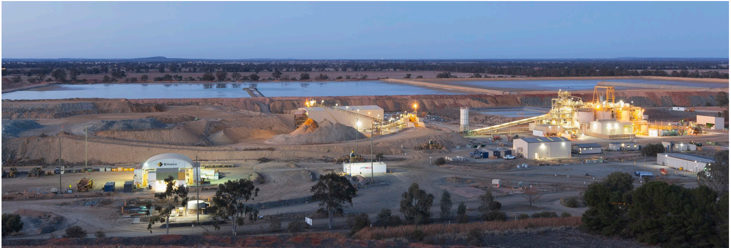
MOD5 will permit construction of a second residue storage facility (RSF)

MOD5 incorporates construction and use of the first two stages of RSF2. Like RSF1, RSF2 will be a nil discharge facility designed to 100% contain the neutralised processing residue from the plant. The new RSF will be constructed immediately to the south of RSF1 and provide sufficient tailings capacity to support processing until the end of 2025, an extension of three years.