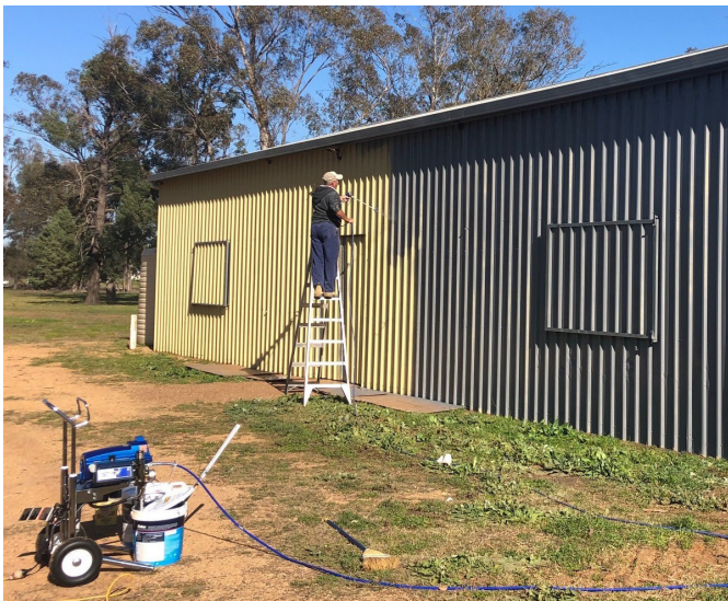
A new look for Mungery Hall

Recipients of the second round of funding in 2020 will be announced in the next newsletter. Finally, last year Mungery Recreation Reserve received $6,930 for painting the hall. We're pleased to share a belated photo of the work being completed.