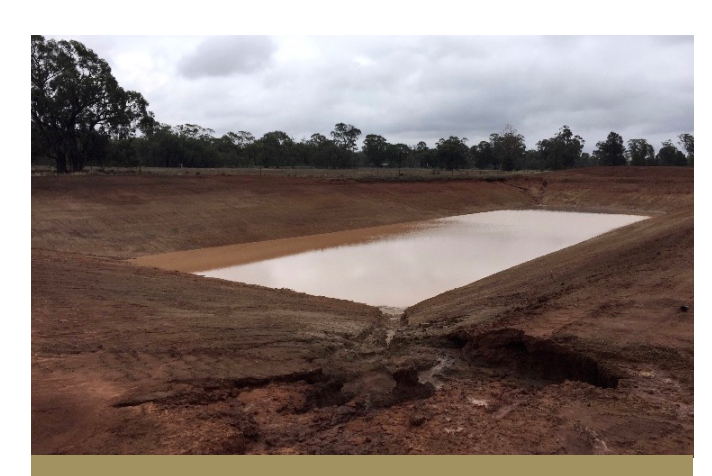
The dam de-silting project at Tomingley recreation ground and race track has boosted the water supply for campers

The Tomingley Sport and Recreation Ground Trust received $18,000 for dam de-silting and associated earthworks to improve the water supply at the Tomingley recreation ground and race track. The dam supplies irrigation water for the lawn, racetrack and recently approved primitive camping area at the ground. The project was completed last October in time for rain catchment in November.