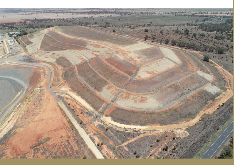
TGO has completed rehabilitation works on the WREs

TGO's progressive site rehabilitation of the waste rock emplacements (WRE) has now concluded. Our surface rehabilitation contractor (Revegetation and Erosion Control Services, 'Reveg') completed outstanding rehabilitation works associated with the WREs in December. This work consisted of topsoil placement, seeding, strawing, construction of drainage and water drop down structures. Reveg completed demobilisation from site in January.