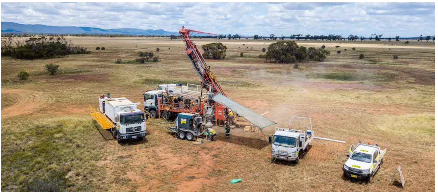
Exploration drilling near TGO.

(For more information about the exploration and resource drilling, refer to the following ASX announcements on the Alkane website ( www.alkane.com.au ): 9 July, 12 August, 23 September and 6 November 2019.)