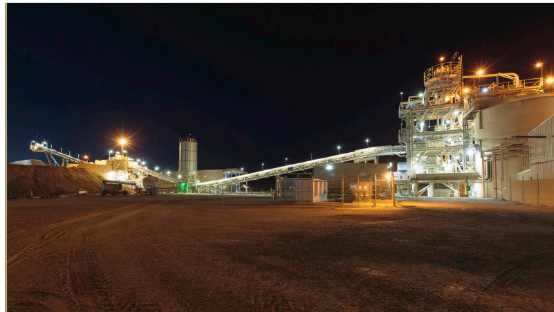
TGO processing plant

We're delighted to have become involved with the Narromine Junior Jets Rugby League Club through a sponsorship of $6000 to assist with the purchase of jerseys for the 2020 and 2021 seasons. The Junior Jets is a very important and successful sporting organisation within the Narromine community, having over 220 players and fielding teams from the Under 6's to Under 16's in the local regions rugby league competition.