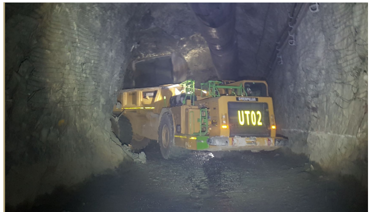
Underground dump truck in action

A second jumbo, as well as a third bogger and truck (as well as other miscellaneous equipment), has recently been purchased to allow for development of the exploration drive, as well as use in our existing operations as needed.