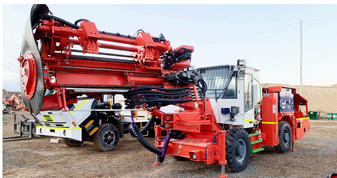
During June, TGO acquired a Sandvik 7-7 V underground drill rig, to be used for drilling all production and cable holes.

TGO has just completed recruiting additional experienced underground truck drivers, loader operators and production drillers, in preparation for underground ore production. The underground team will ultimately expand by 12 people to a total of 49, most of whom will all reside locally (Tomingley, Narromine, Dubbo and Peak Hill).