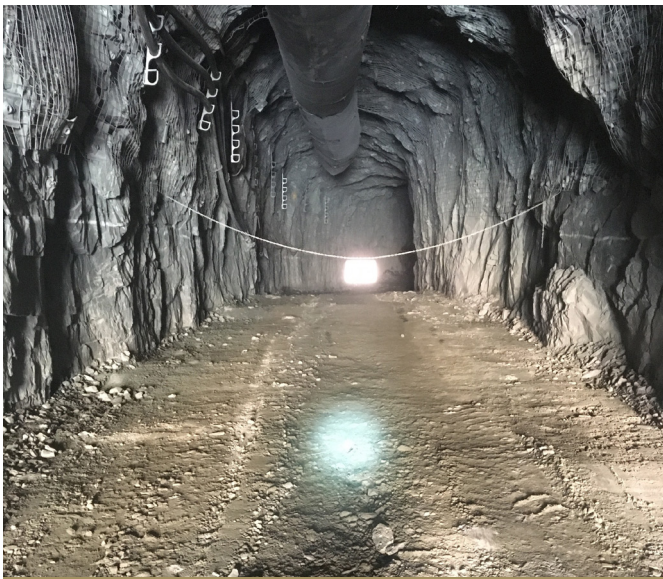
Photo of the underground decline

Following the establishment of two portals (main decline and vent) early in the year, the TGO underground development has proceeded at an excellent rate of approximately 300 metres per month since February 2019. This result has been achieved with a single jumbo and reflects the commitment of our highly skilled underground team.