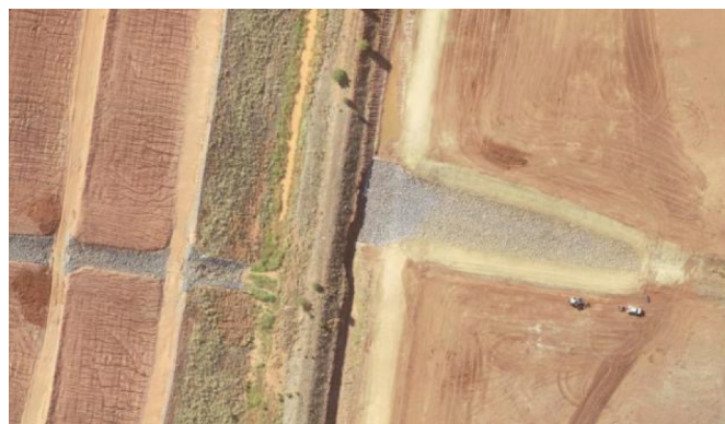
Completed remediation works on the middle section of the Eastern Drain.

The construction work on the eastern drain covered a length of approximately 1.6km, part of which affected TGO-owned lands leased to farmers. We re-shaped run-off surfaces, seeded batters, and re-installed the mine boundary fence.