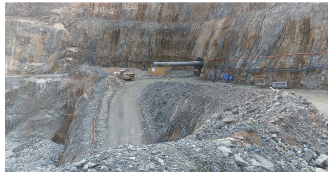
The portal for the main decline is in the Wyoming One open cut.

The main decline spirals down outside the ore zone below the Wyoming One open cut, as illustrated. The development of the decline has reached the third of several levels of ore. We have also commenced developing the first ore level, with ore from the first underground stopes scheduled to commence production before the end of the year.