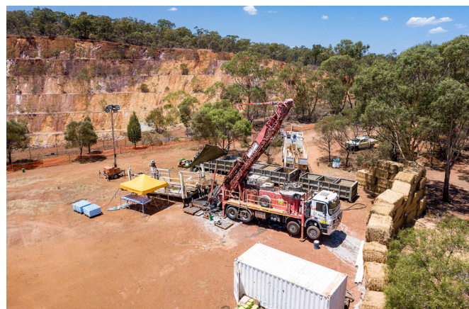
Exploration drilling at the Peak Hill Gold Mine in January.

Alkane retains its Mining Lease and Environment Protection Licence for Peak Hill Gold Mine, but any further mine development will require government approval – along with a comprehensive environmental assessment and consultation with the community and Parkes Shire Council. This would be expected to take more than a year; but the first step is to make sure that any potential mine development is economically feasible.