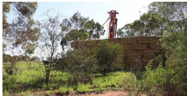
Diamond drilling near Peak Hill in January