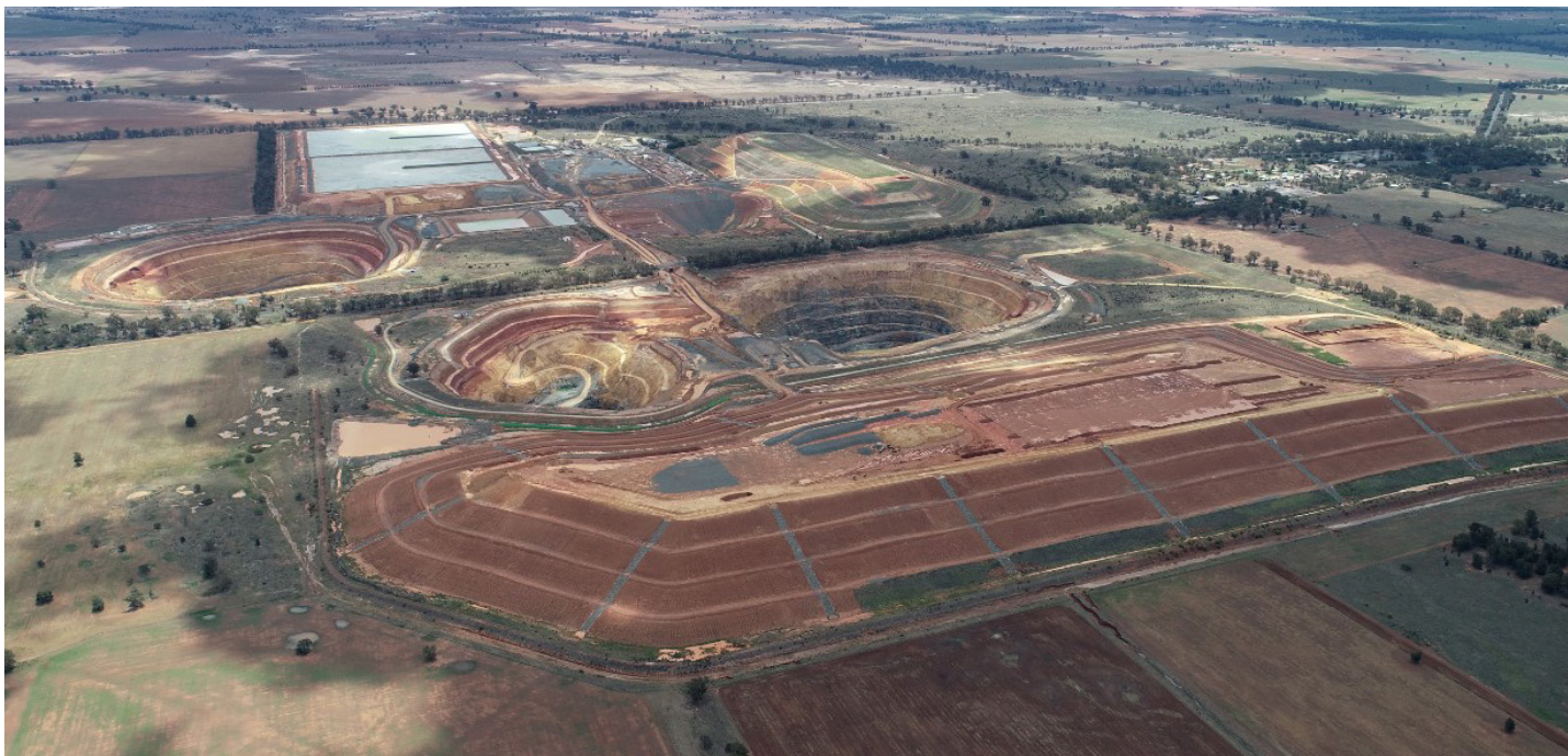
Shaped waste rock emplacements at TGO