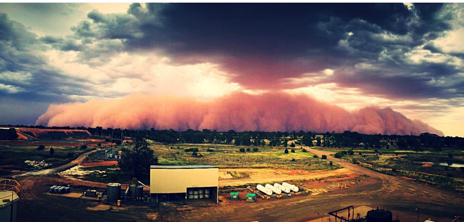
Dust storm approaching TGO from the west near sunset on NYE 2018. Photo by Jason Walters from the top of the processing plant.

Li'l Tackers Playgroup Tomingley Currently located in the old Tomingley School building, the Li'l Tackers Playgroup services farms and villages in the vicinity of Tomingley. Funding of $3590 was granted to support the creation of a 'Baby Safe Zone'. This provides a separate safe space for the littlest kids to play, out of range of the older children.