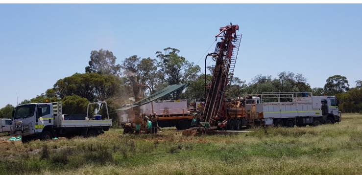
Reverse Circulation drilling at Roswell prospect 24 January 2019

We’ve also commenced a ten-hole diamond drilling program at Peak Hill to test the sulphide ore below the Proprietary Pit – a site of earlier mining. To minimise noise from the drill rig, which is operating 24/7, we’ve built a sound wall of hay bales. This drill program is filling in data gaps in the ore resources. The previous drilling was completed in 1998.