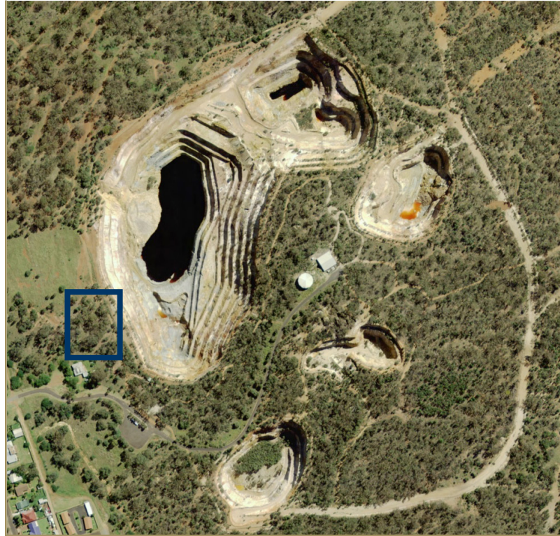
Proposed location of core sampling

Alkane retains its mining leases (administered by Department of Planning and Environment – Division of Resources and Energy) and Environment Protection Licence, but any future development of the Peak Hill Gold Mine would require a comprehensive environmental assessment and consultation with the community and Parkes Shire Council, which would be expected to take more than a year. This process will not commence unless the underground mine development is deemed feasible.