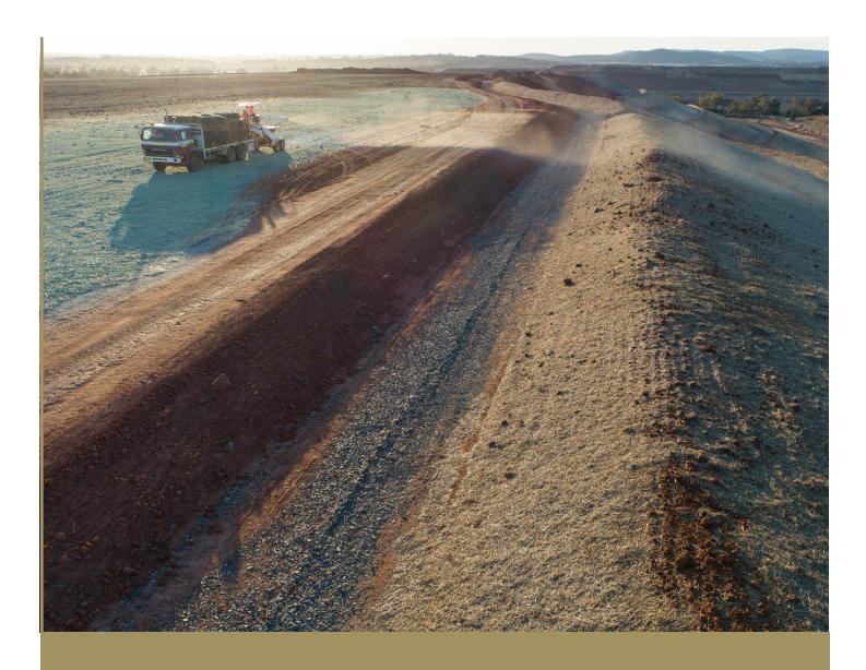
Rehabilitation of waste rock emplacements continues with seeding of vegetation

There is still a fair amount of rehabilitation activity onsite, with large dozers continuing to shape the waste rock emplacements and ongoing seeding of vegetation.