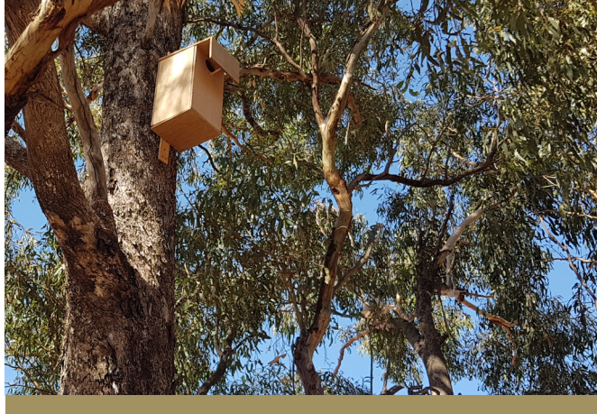
A nesting box in place, ready for native residents