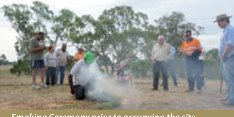
Smoking Ceremony prior to occupying the site

Registered Address: 65 Burswood Road, Burswood WA 6100 Telephone: +61 8 9227 5677 Facsimile: +61 8 9227 8178 mail@alkane.com.au ww