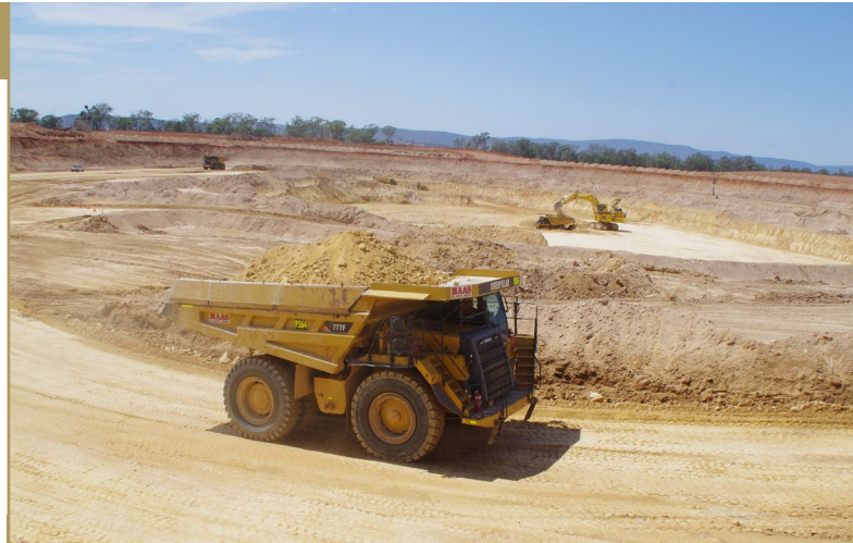
Mining has commenced

The pour also marks the completion of commissioning and commencement of operations for TGO. Construction of the mill has now been completed, bringing the construction program at the Tomingley site to an end. The focus of TGO activities now turns to maximising mining productivity, completing and optimising processing methods, and managing overall production costs as gold mining begins in earnest.