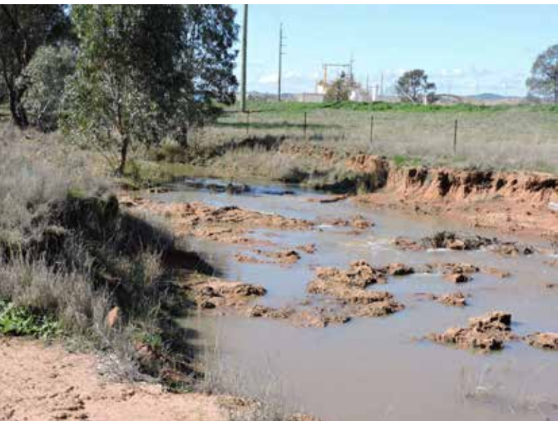
Gundong Creek is included in the site Biodiversity Offset

The Gundong Creek, which runs through the TGO mine site, flowed for the first time since before construction started in early 2013. The creek is included in the site Biodiversity Offset, and the exclusion of stock from the creek banks has vastly improved the amount and quality of vegetation growing there.